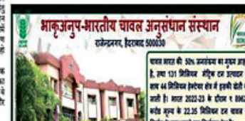
भारत के 50 प्रतिशत जनसंख्या हिन्दी भाषी है। अतः यह हिन्दी को किसानों तक हमारी पहुंच का प्रमुख साधन बनाना आवश्यक है।

हिन्दी भाषी किसानों को प्रमुख साधन बनाना आवश्यक है।